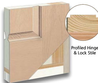
Profiled Hinge & Lock Stile

1-1/4" lock stile reinforced with full length 2-3/4" LVL internal stile for strength and stability.